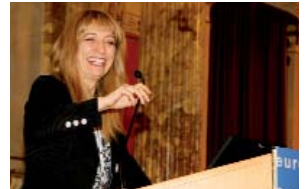
Baroness Prof. Susan Greenfield Oxford University