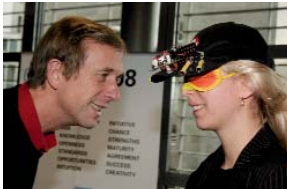
Prof. Kevin Warwick University of Reading, Dept. of Cybernetics