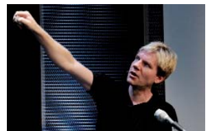
Prof. Bjorn Lomborg Copenhagen Business School